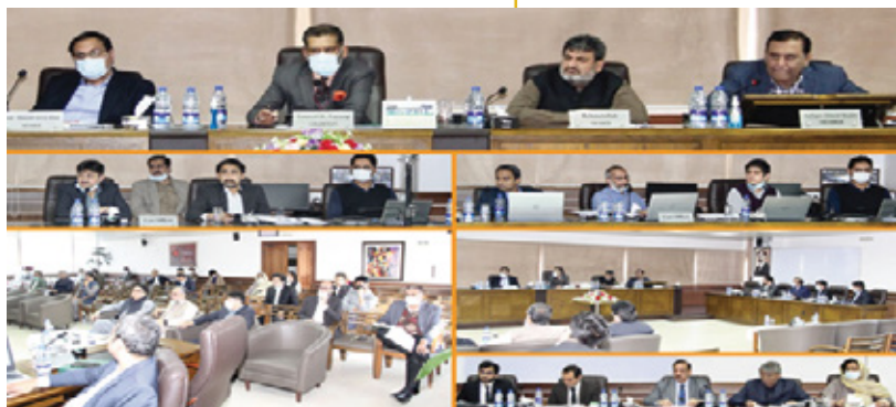
Public Hearings on the applications/petition of FESCO for adjustment in Tariff for FY 2021-22 and by LESCO for modification of re-determination of the NEPRA regarding Multi-Year Consumer End Tariff held at Islamabad.

Public hearings regarding recommendation of extension of incremental consumption package for K-Electric Industrial Consumers and Winter Incentive Package for electricity consumers on incremental construction for K-Electric and XWDISCOs by the Federal Government held at NEPRA HQs Islamabad.