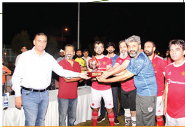
NEPRAs 2nd Inter Departmental Futsal tournament 2021.

Chairman NEPRAs along-with NEPRAs employees celebrated Christmas in solidarity with Christian employees. On that occasion, Chairman NEPRAs on behalf of NEPRAs extended Christmas greetings to the Christian employees followed by cake cutting ceremony.