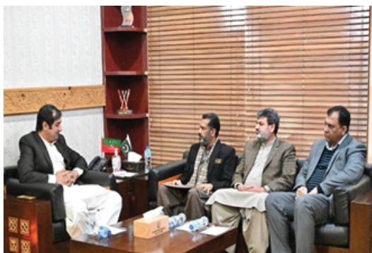
NEPRA Authority called on Chief Minister Gilgit Baltistan