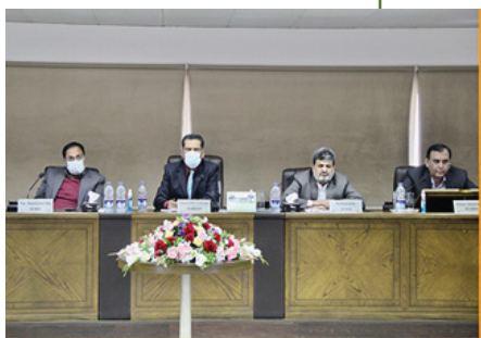
Public Hearing Regarding Fuel Charges Adjustment of XWDISCOs for the Month of November 2021 held at NEPRA.

Chairman NEPRA delivered a detailed presentation to the professionals of National Institute of Management (NIM) about NEPRA mandate & structure, its policy framework & current measures for alternative power solutions.